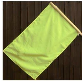
Stop Race Flag