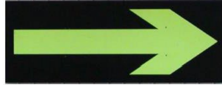
By-Passing Direction Arrows