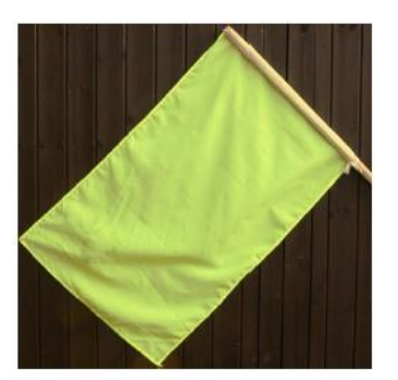
Stop Race Flag